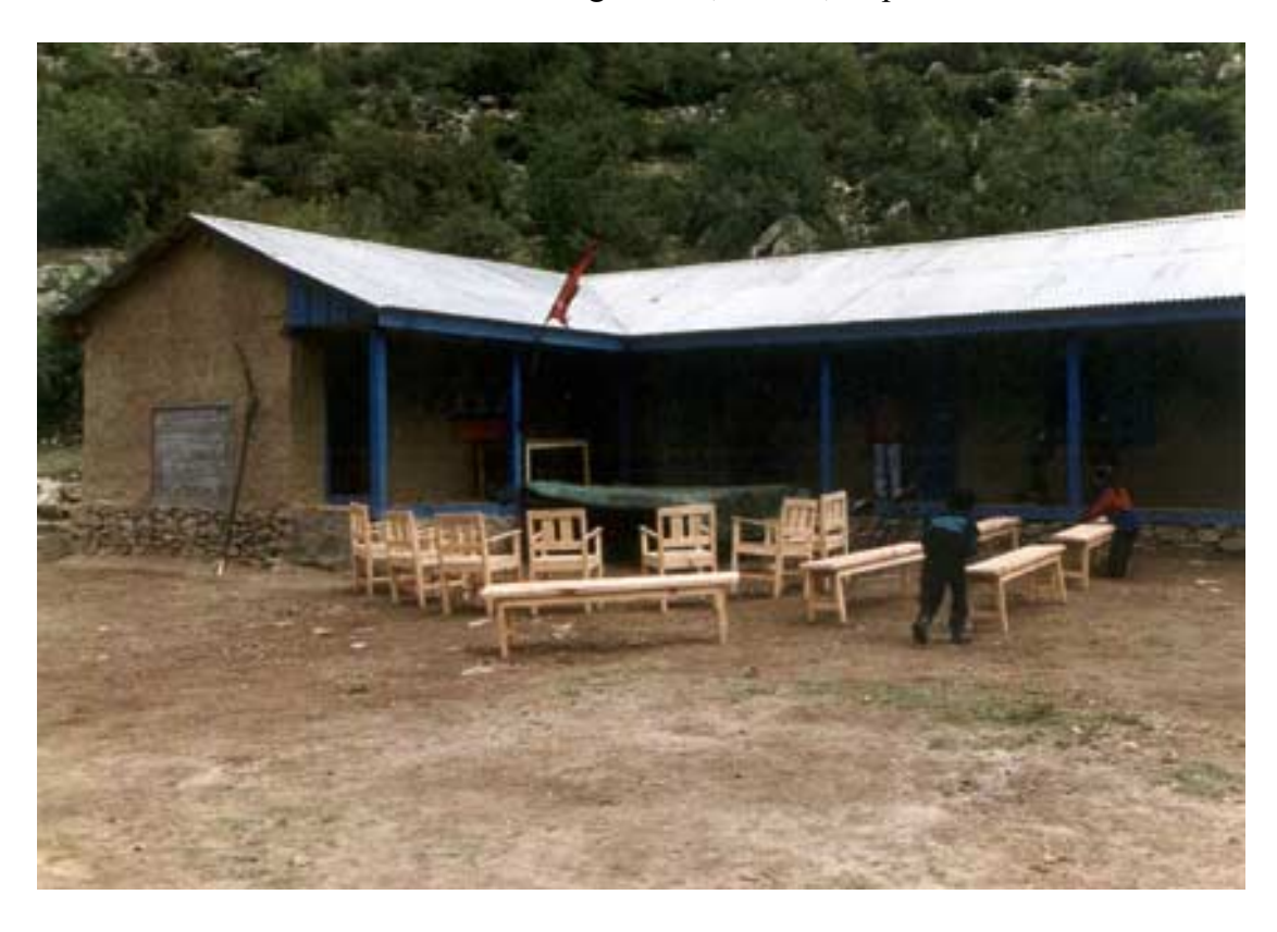
The ISIS Foundation: January 2001 – June 2001