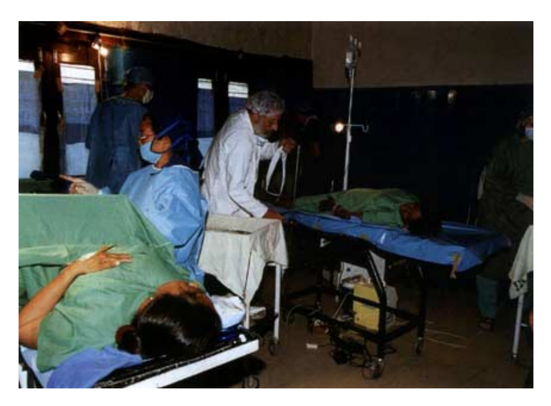
Obstetrics and Gynaecology Surgical Camp, INF, May 2000 The transporting of equipment and the camp itself.