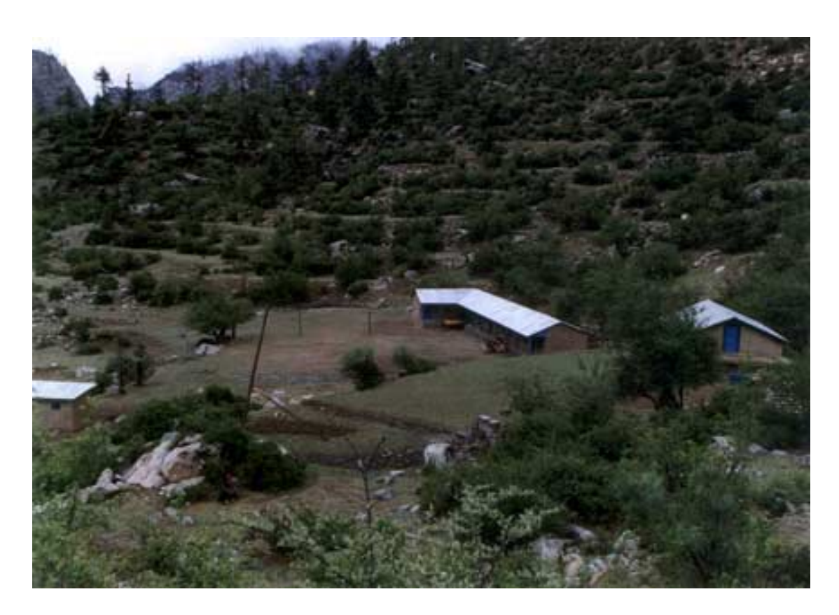
The new Yalbang School, Humla, Nepal