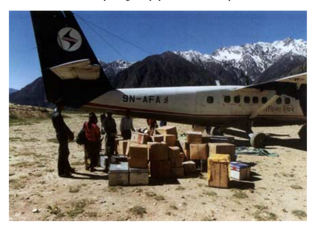
The ISIS Foundation: January 2001 – June 2001