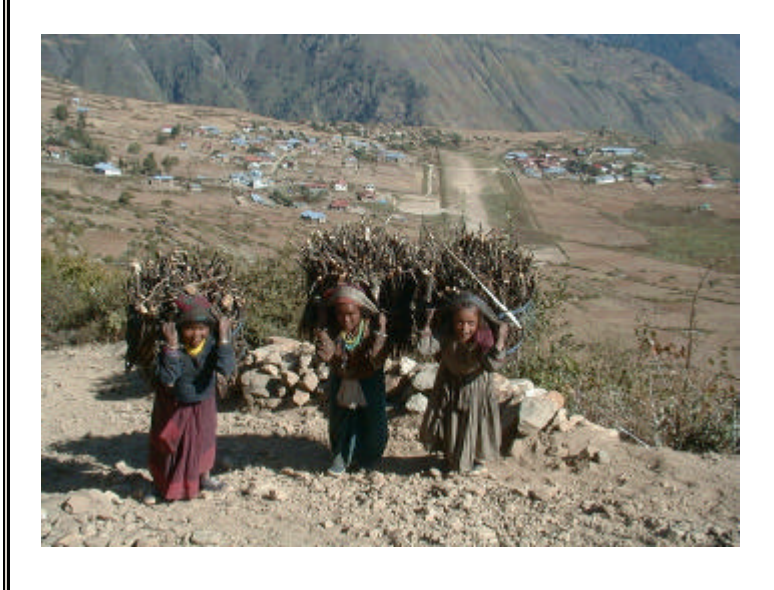
Plate 6 : Girls carrying wood for stoves, above Simikot in Humla (airstrip in background).