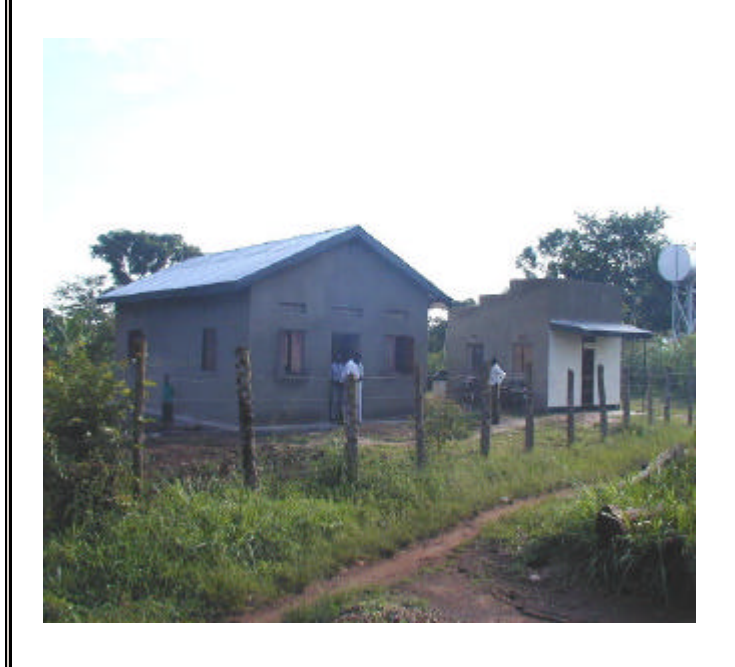
Plate 13: The ISIS funded Community Based Health Care Hall.