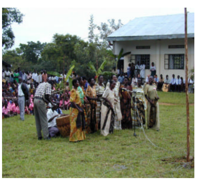
Plate 14 : The opening of the CBHC Hall; performance by Traditional Birth Attendants.