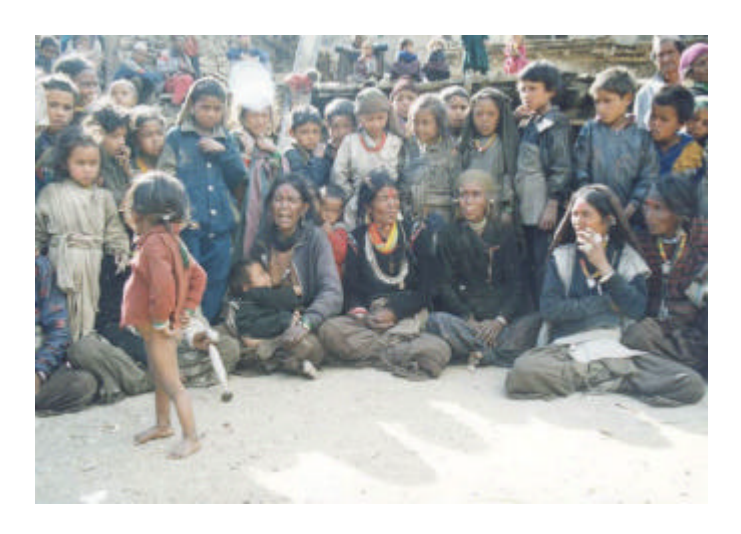
Plates 3 – 5 : Karnali Natya Samuha, Nepalese Theatre Group, performing on health and sanitation in Humla.