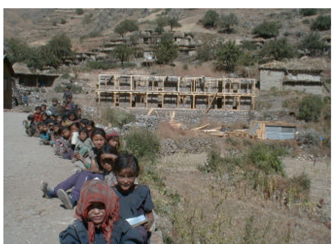
Plate 8 : The current sub-health post at Syanda; this will be demolished to make way for the new sub-health post in 2002.