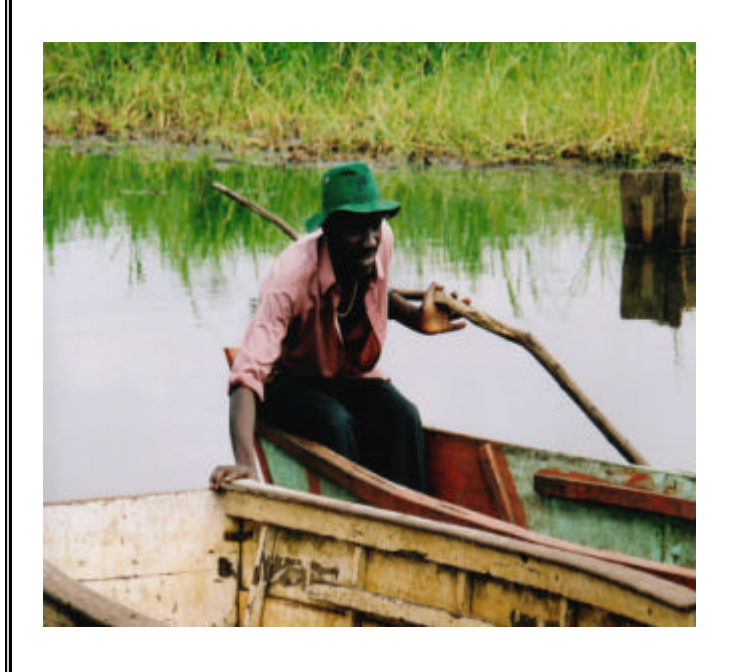
Plate 11 : Transportation in Ngomo, Luwero district.