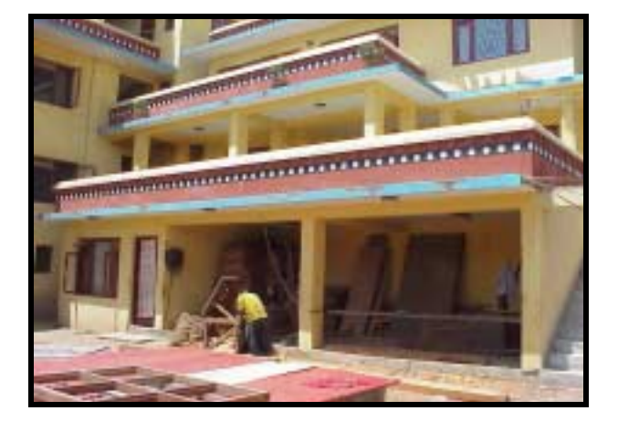
<u>Plate 8</u>: The Benchen Gompa Clinic (Himalayan Medical Foundation)