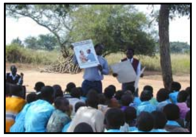
Plate 21: HIV/AIDS lecture, CBHC staff