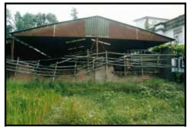
<u>Plate 10</u>: Before renovation