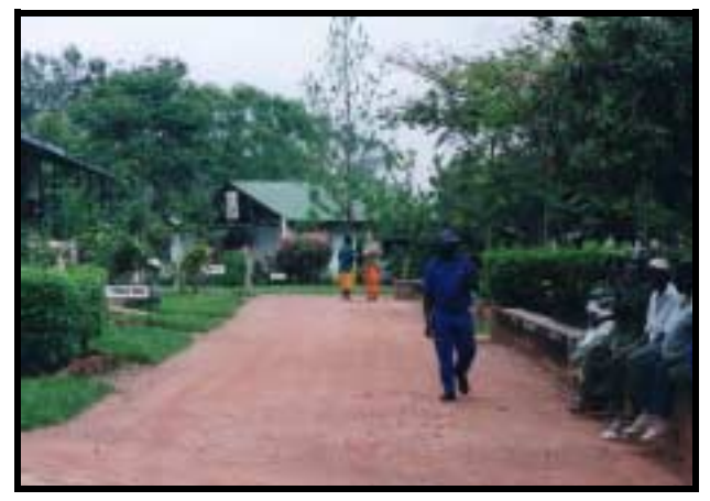
Plate 18: Outside the Outpatients ward