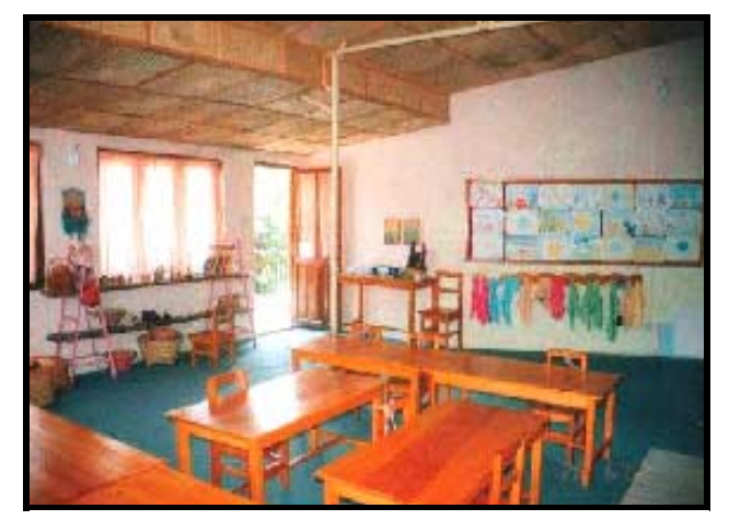
Plate 15: The finished school