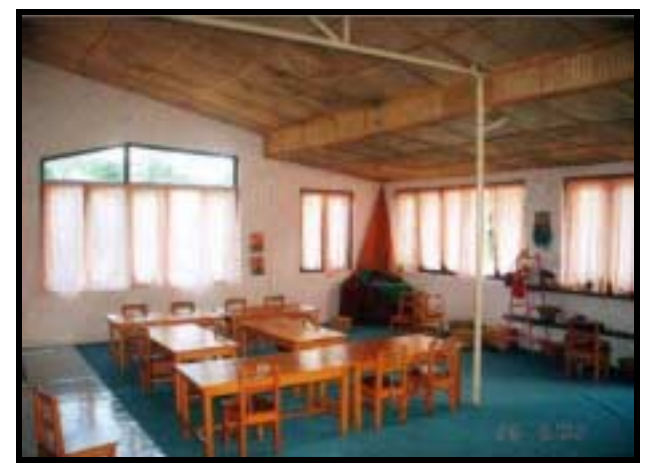
Plate 14: After renovation