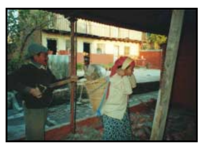
Plate 11: During renovation