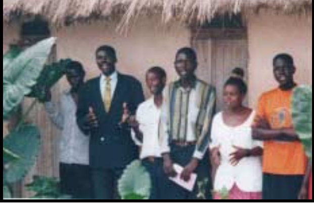
<u>Plate 20</u>: Kiwoko Hospital AIDS Orphans Drama/Singing Group