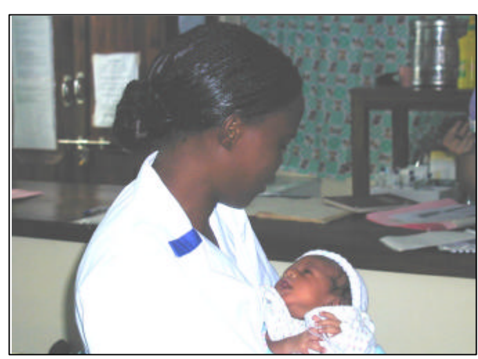
Plate 13: Another tiny patient in the NICU