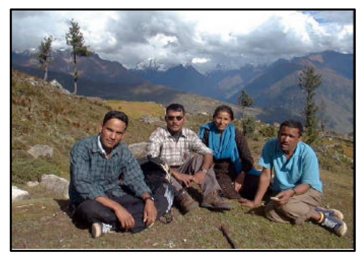
Plate 6: The team of Jumli staff working in Humla