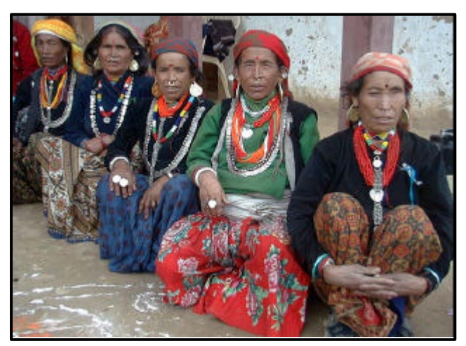
Plate 5: Traditional Birth Attendants in Humla, Nepal, attending training by USCCN