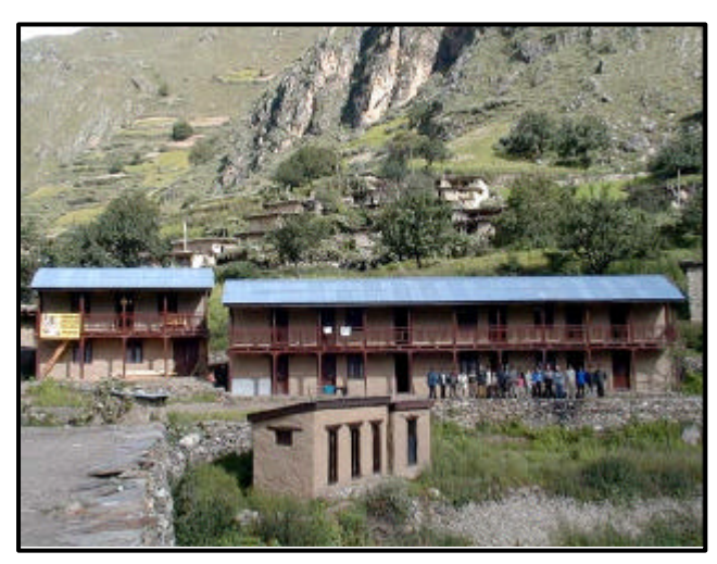
Plate 3: Chauganphaya Hostel Complex