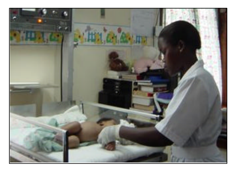
Plate 5: One of the Nurse/Midwives in the ICU, helping a tiny patient at Kiwoko Hospital (see Section 2.1.1.).