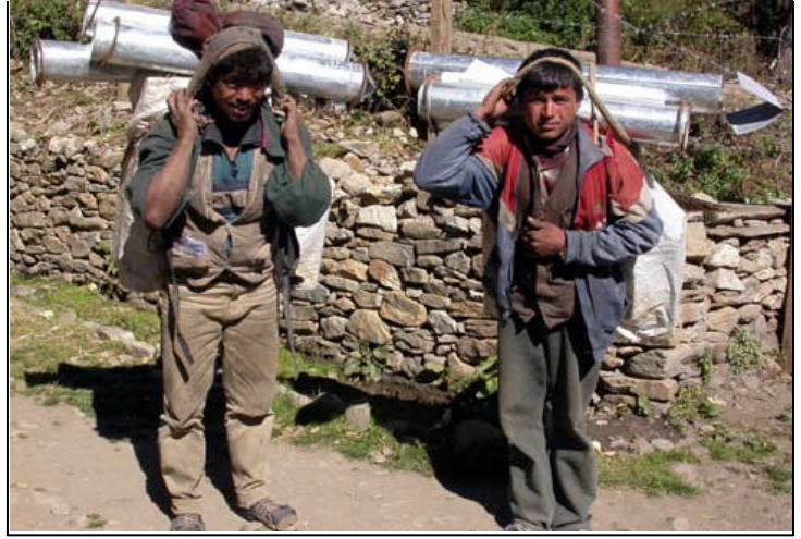
Plate 9 - After undertaking the three-day training programme on installation and maintenance, locals in Humla carry the materials for their smokeless stoves back home. These stoves substantially reduce the smoke in homes, and thus respiratory illnesses and burns in children. They weigh around 38 kg (84 pounds) so it is no easy walk back up the mountains (see Section 3.1.).