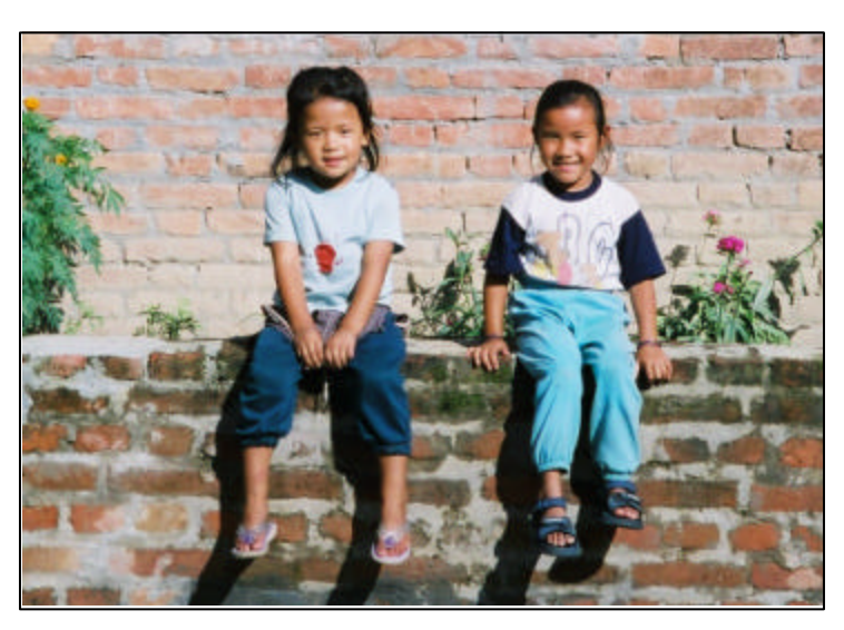
Plate 11 – Kids at the newly renovated Tashi Waldorf School. A wonderful transformation has taken place at this school over the last three years (see Section 3.3.2.).