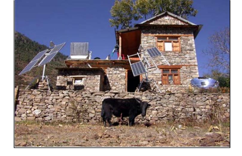
Plate 8 - The Kathmandu University/ ISIS Office in Simikot with a visiting yak in the front yard. Only accessible by plane from Nepalganj, on the Indian border, Simikot is 12 000 feet up in the Himalayas. The 10 room office is home to around eight staff, who then trek to even more remote villages to assist with smokeless stove and pit latrine installation, and install solar power and safe drinking water (see Section 3.1.).