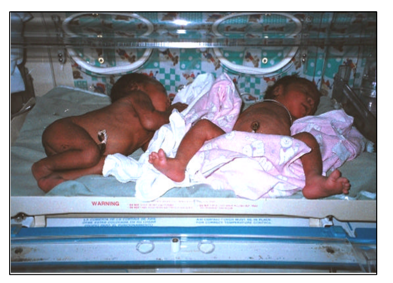
Plate 4: Stretch those legs! Twins in the Neonatal ICU can now have a cosy introduction to life in one of the nine incubators that we have sent from Seattle to Uganda (see Section 2.1.1).