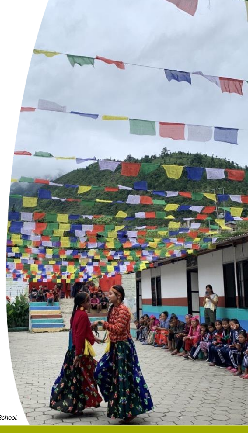
Photo: Traditional Nepali dance performance from two students of Shree Ghyangfedi School.