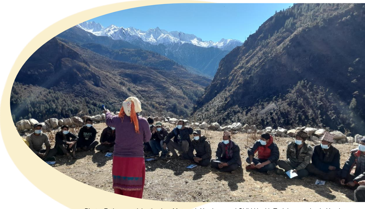
Photo: Fathers participating in a Maternal, Newborn and Child Health Training session in Humla