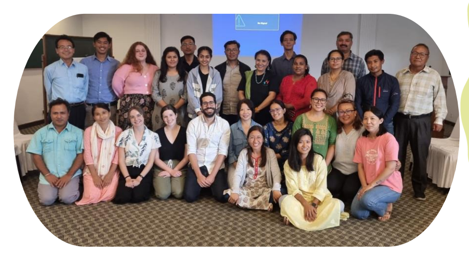
Photo: Participants of the Remote Community Development Strategy Summit, including visiting staff from Adara Development (Australia)