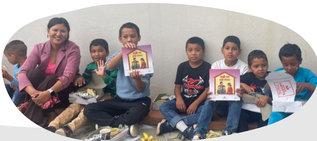
Photo: Students reading 'Our Home: Our Family' children's story book about child protection