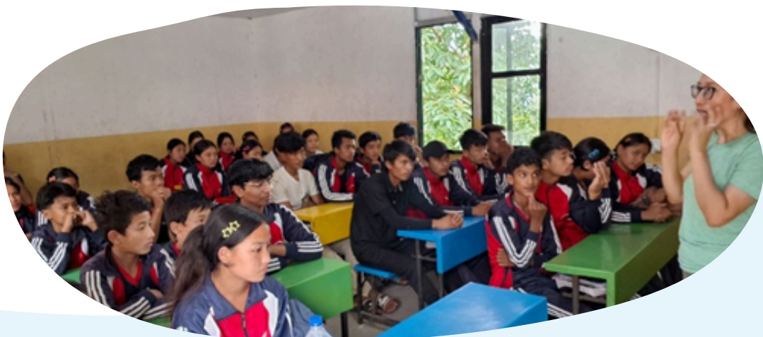
Photo: Youth manager teaching high school students about the dangers of early marriage