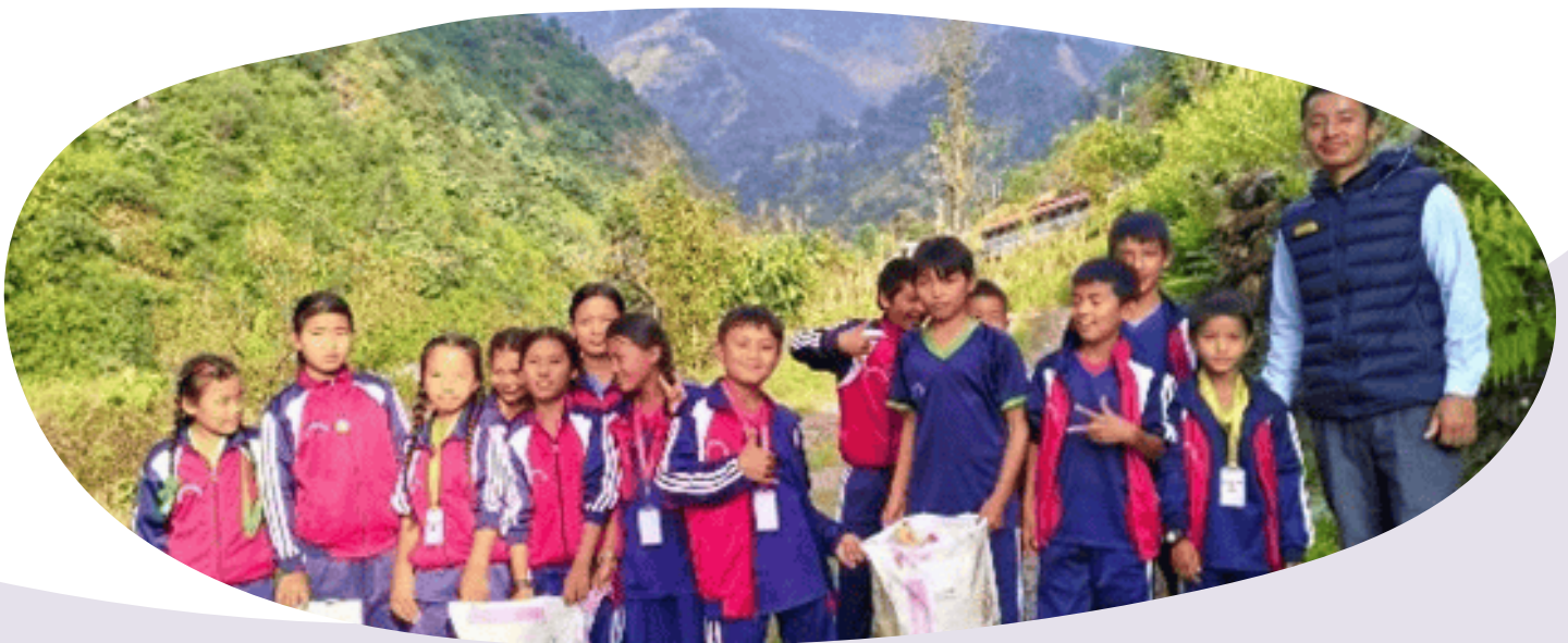
Photo: Ghyangfedi students participating in Adara's partner, AXIS' World Clean Up day in October 2024.