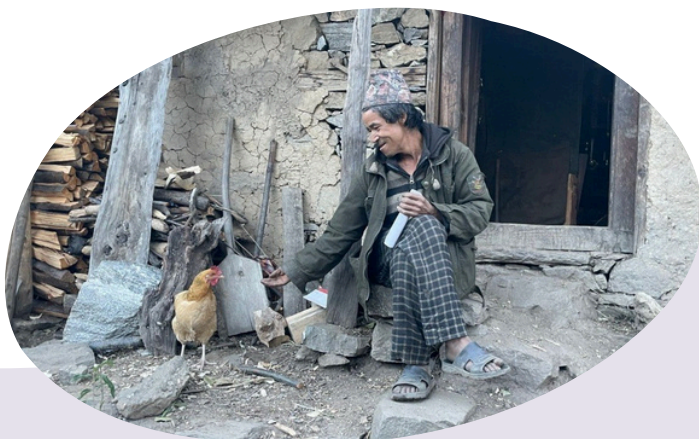
Photo: Poultry farmer, Syada