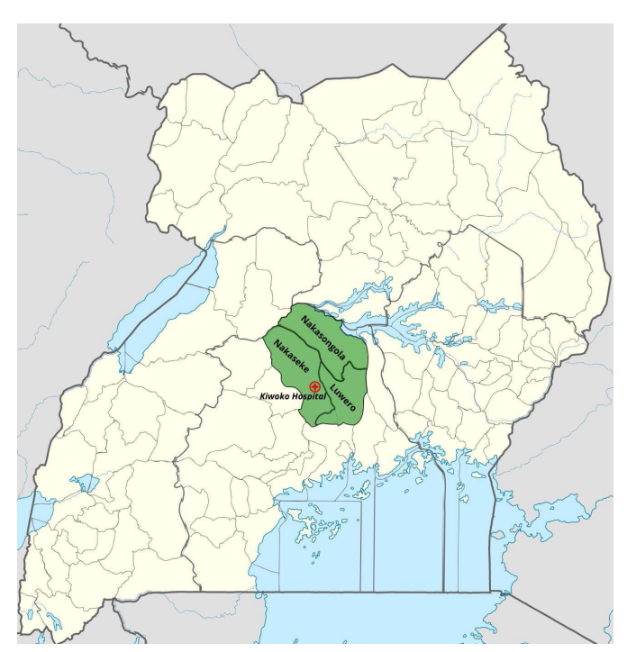
Figure 2 Map showing Hospital to Home study districts.