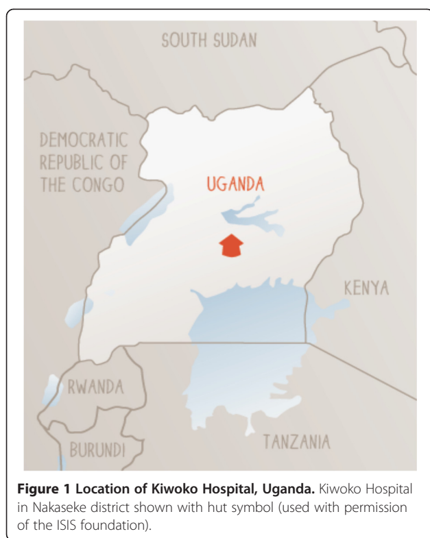
Figure 1 Location of Kiwoko Hospital, Uganda. Kiwoko Hospital in Nakaseke district shown with hut symbol.