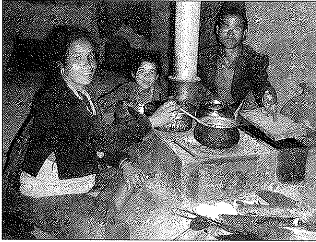
A family enjoys a smokeless stove.