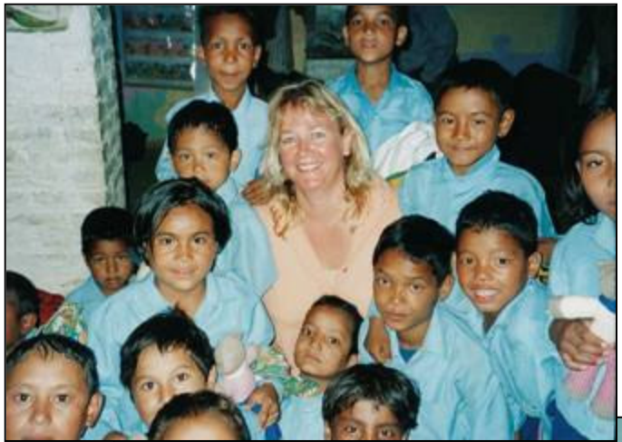
<u>Plates 3 & 4</u>: (left and below) Children at the Himali Orphanage – we are providing food and medical care for these mountain children, who have been sent to Kathmandu for their safety from the vagaries of the civil war. The mountains are the centre of Maoist and Army activity.