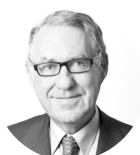
David Gonski AC