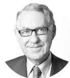
David Gonski AC